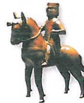
A medieval knight

The desire to control Jerusalem, which led to the Crusades, is still a cause of conflict. Use CNNfyi.com or other current events sources to learn what is happening in Jerusalem today. Record your findings in your journal.